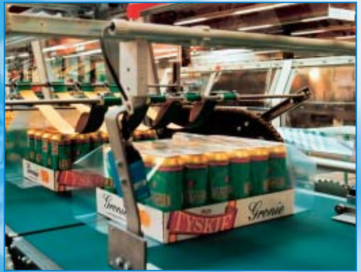
WrapAroundShrinkPacker: Combination of WrapAroundPacker and ShrinkPacker

The KHS Kisters WrapAround Packaging Process is an economical alternative to the using pre-folded cartons. The wrap around blanks cost less and can incorporate display cut-outs, carrier holes, integrated carrier handles, perforations for easy opening and excellent possibilities for promotional printing.